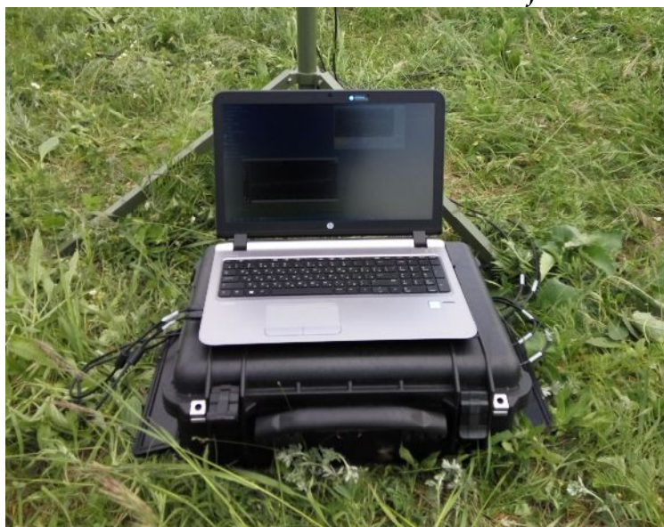
External view of “Panorama-F”

Results of detection are recorded into the database, with the opportunity to edit, sort and print.